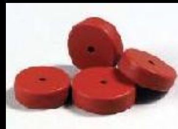
Septa with Guide Hole