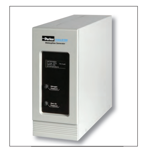
MGG-2500NA FID MakeupGas Generator

Parker Balston's MGG-400NA and MGG-2500NA, MakeupGas Generators can provide nitrogen gas and zero grade air to FID detectors on Gas Chromatographs. These systems are specifically designed to provide only nitrogen gas or both nitrogen and zero air to 5-6 Flame Ionization Detectors.